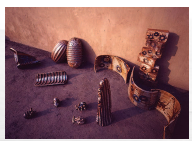
Background image, all pages: Desierto al Sur de Lima. Facing page: Desierto al Sur de Lima. Above left: Into White/Hacia el Blanco. Top right: Vessels (Detail). Above: Objects at Puruchuco (Detail).

paternal grandfather was an early aviator and aerial photographer.